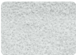
*Zincalume® S T R1 R2